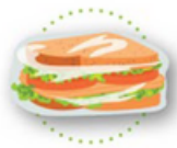
Ziploc & other reclosable food storage bags