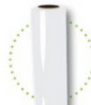
Pallet wrap & stretch film