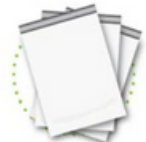
Plastic shipping envelopes